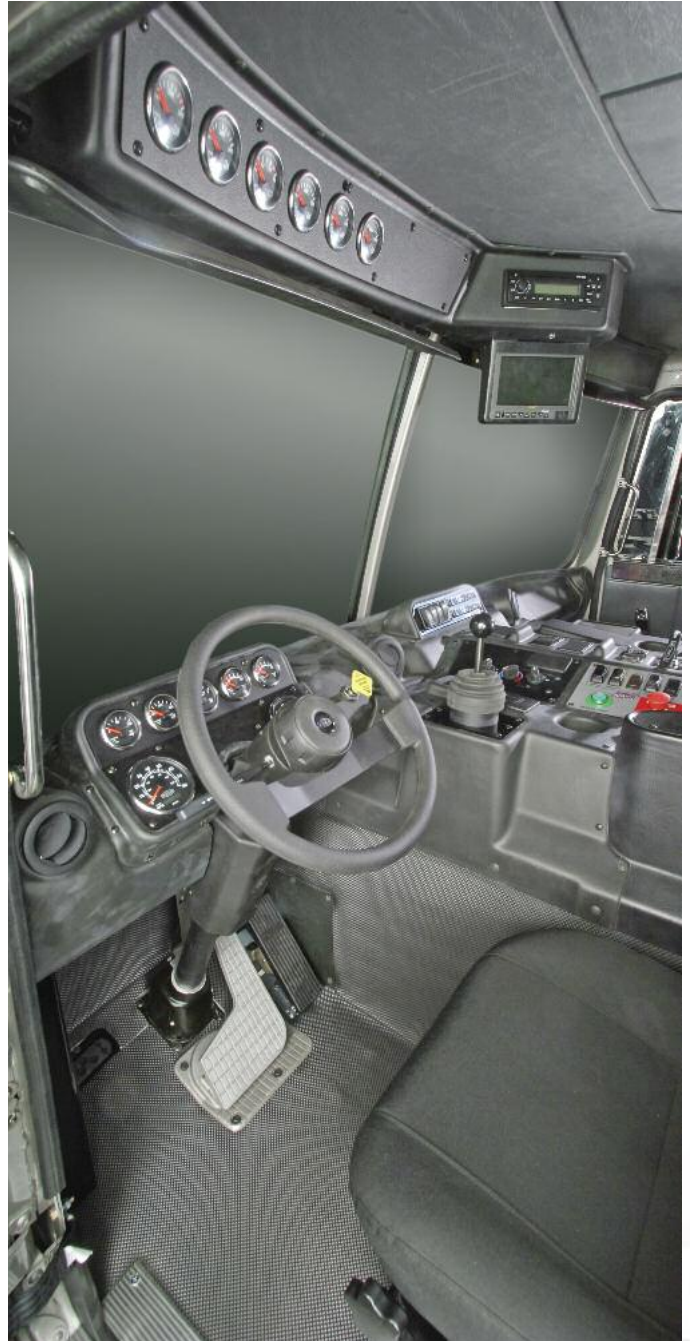
The Autocar Xpeditor has roomier cabs with more options and greater convenience than any other low-cab truck.