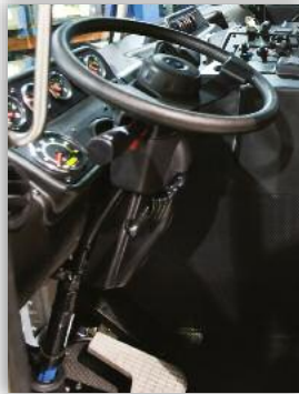
New tilt wheel for comfort and control