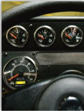
Clear, easy-to-read gauges improve safety and convenience

All of the Xpeditor's competitors use fiberglass and composites in their cabs and/or doors. Autocar's ACX is the only cab – doors included – that's manufactured entirely of fully welded, two-sided galvanized steel. Add in an electronic, fully-blended HVAC system with 28% better efficiency, a multiplexed electrical system with integrated diagnostic capabilities and you'll understand why the Xpeditor claims the title of "hardest-working cab in the business."