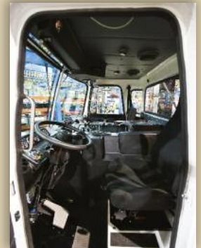
Expanded operator room – increases comfort and productivity

There's nothing tougher than the demands placed on vocational trucks – frequent starts and stops, short runs, big loads, rough terrain, tight areas, heavy power demands, tough traffic and weather, not to mention meeting the demands for operator comfort and productivity. With the strongest cab in the industry and the best overall strength-to-weight ratio, the Autocar Xpeditor ACX continues to be the hardest-working LCF truck you can buy. And, they offer the lowest overall cost of ownership in the LCF market.