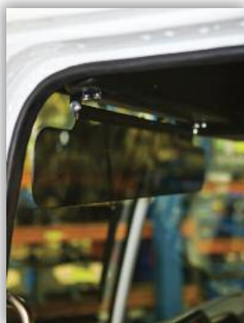
Fold-away opaque sun visor enhances visibility and safety