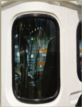
Corner windows in B-Pillars improve visibility and safety