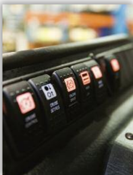
Large illuminated rocker switches for easy operation