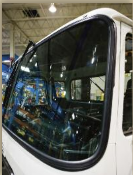
Curved windshield with narrow A-Pillars improve peripheral vision