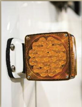
High visibility LED marker lights increase road safety

There's nothing tougher than the demands placed on vocational trucks – frequent starts and stops, short runs, big loads, rough terrain, tight areas, heavy power demands, tough traffic and weather, not to mention meeting the demands for operator comfort and productivity. With the strongest cab in the industry and the best overall strength-to-weight ratio, the Autocar Xpeditor ACX continues to be the hardest-working LCF truck you can buy. And, they offer the lowest overall cost of ownership in the LCF market.