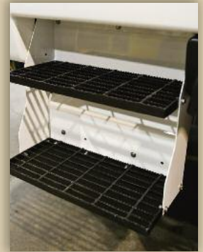
Lowered cab for easier access and safety